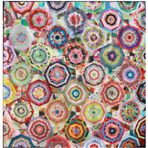
Pillow size: 20' x 20